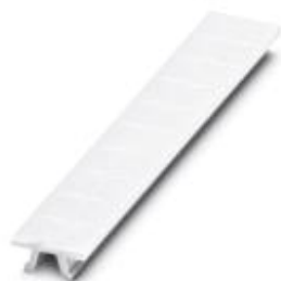
Zack marker strip, 10-section, horizontally labeled with the consecutive numbers: 81 ... 90, white, width: 6 mm

Please be informed that the data shown in this PDF Document is generated from our Online Catalog. Please find the complete data in the user's documentation. Our General Terms of Use for Downloads are valid ( http://phoenixcontact.com/download )